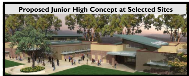
Proposed Junior High Concept at Selected Sites