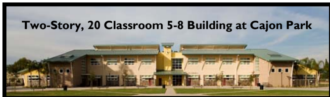
Two-Story, 20 Classroom 5-8 Building at Cajon Park